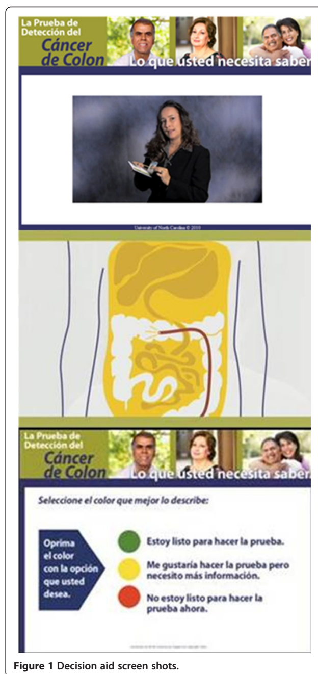
Figure 1 Decision aid screen shots.

Data collection Participants were enrolled by telephone and completed a baseline questionnaire during the initial phone contact. The baseline questionnaire assessed CRC