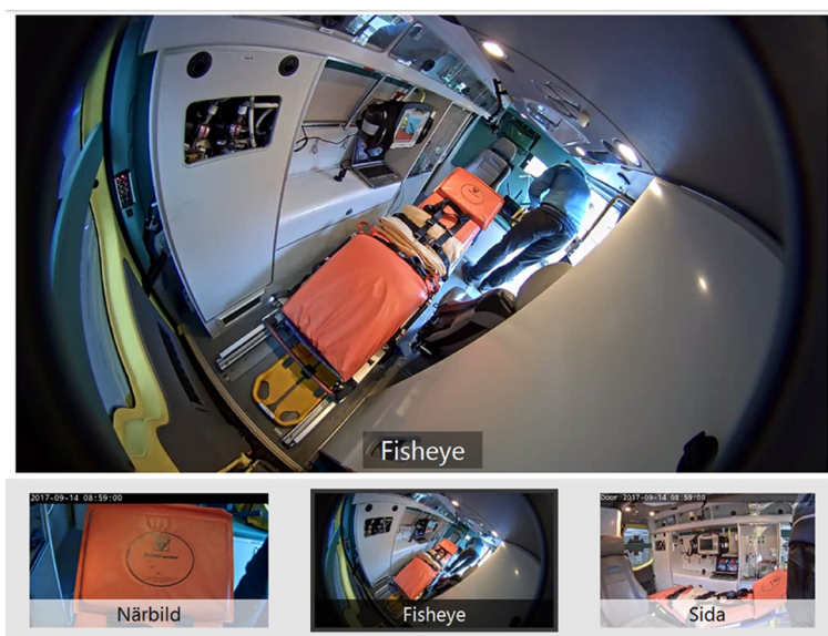
Fig. 2 Remote view of the ambulance, including overview (“fisheye”, top and lower middle), close-up (“närbild”, lower left) and side-view (“sida”, lower right). Any of the three views could be selected as the main, enlarged view (top). The laptop placed to the left of the stretcher was used to provide the EMS clinicians with the possibility to see the images sent to the remote consulting neurologist