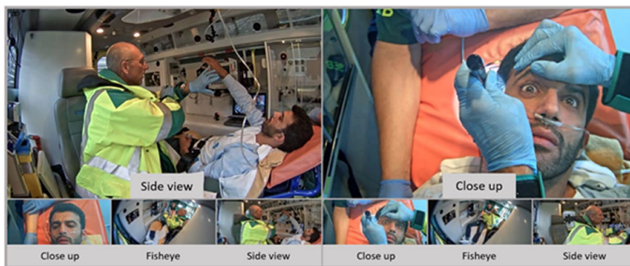
Fig. 3 Neurologists view during consultation, views cover both EMS clinician and patient. Patient was represented by an actor