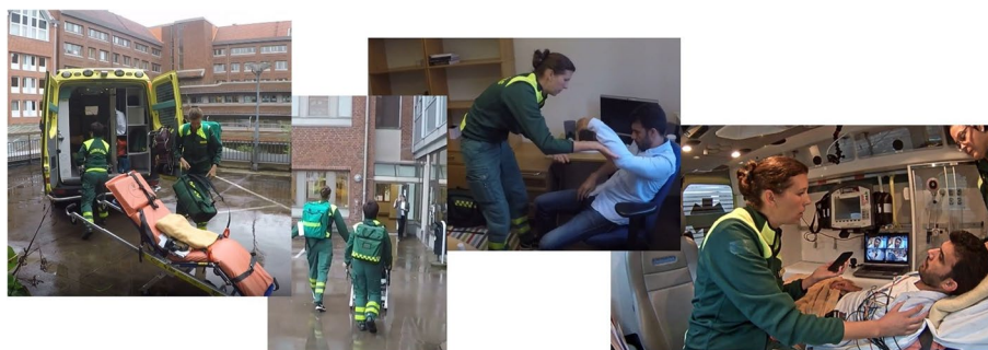
Fig. 1 Simulation design illustrating EMS clinicians’ responding to a severe stroke that struck the patient (represented by an actor) at work